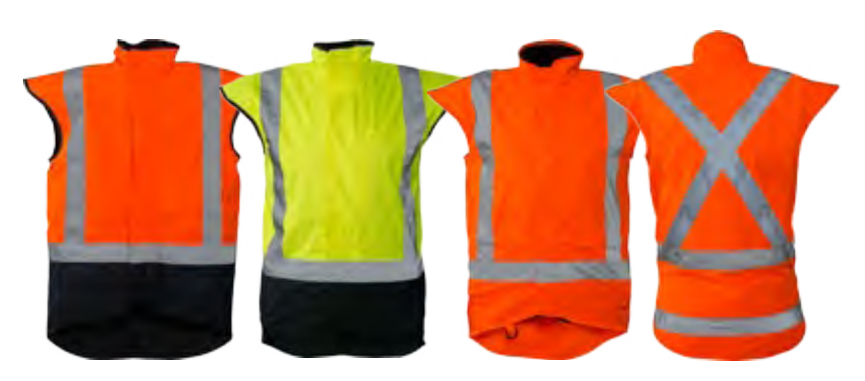
PCR4000-OR/NA PCR4000-YE/NA PCR4010 PCR4011