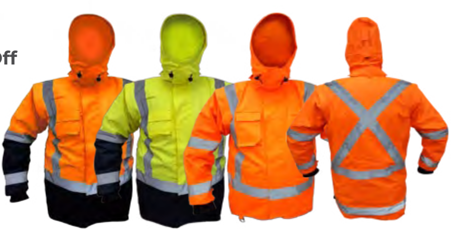
PCR4015-OR/NA PCR4015-YE/NA PCR4016 PCR4017